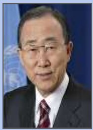
H.E. Ban Ki-moon Secretary-General, United Nations