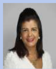
Luiza Trajano President and CEO Magazine Luiza (Brazil)