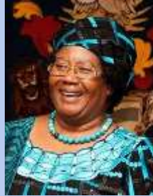
Joyce Banda, President Malawi