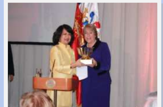
President Michelle Bachelet receiving the Award at the 2009 Summit in Santiago, Chile.