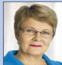
Maud Olofsson Deputy Prime Minister, Sweden