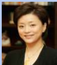
Yang Lan Co-Founder and President, Sun Television Cybernetworks China