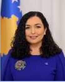
H.E. Vjosa Osmani President, Kosovo