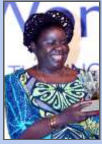
Luisa Diogo Prime Minister, Mozambique