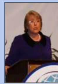
Michelle Bachelet President, Chile