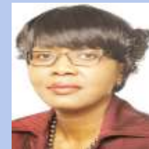
Saraa Kuugongel- wa-Amadhila Prime Minister, Namibia