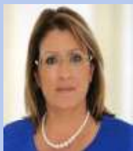
H.E. Marie Louise Coleiro Preca President of Malta