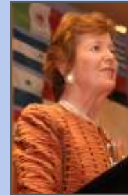
Mary Robinson President, Ireland

Former President, South Africa At the 2000 Global Summit of Women