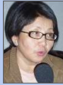
Hon. Roza Otunbayeva,