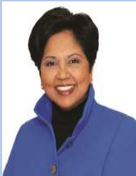
Indra Nooyi Chairman & CEO PepsiCo