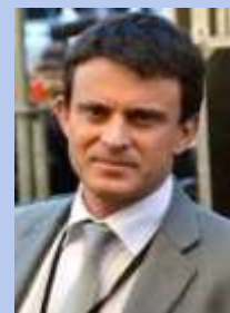
Manuel Valls Prime Minister, France