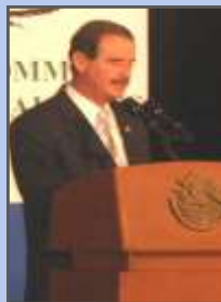
Vaira Vike Freiberga President, Latvia