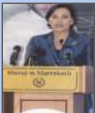
H.E. Princess Lella Hasna, Morocco