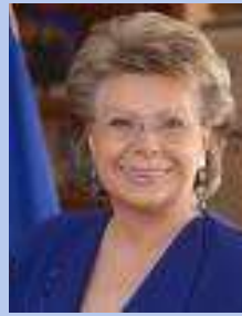
Hon. Viviane Reding Vice President, European Commission President, Kyrgyzstan