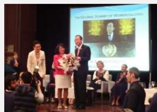
UN Secretary-General Ban Ki-moon receiving the Award at the 2011 Summit in Is-