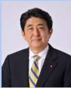
H.E. Shinzo Abe Prime Minister, Japan