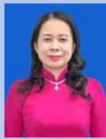
H.E. Vo Thi Anh Xuan Vice President, Vietnam