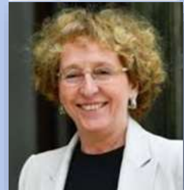
Muriel Penicaud , Minister of Labor, France (2017-2020)