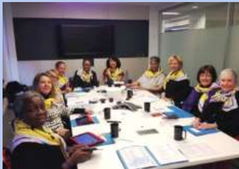
IPC members gather for a meeting in Washington, DC to prepare for the upcoming Summit.