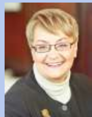
Henryka Bochniarz CEO, Boeing Central & Eastern European Region