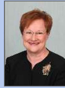
Tarja Halonen President, Finland