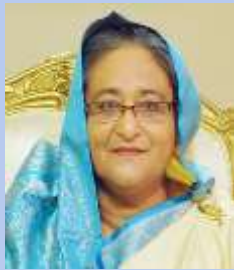
H.E. Sheikh Hasina Prime Minister, Bangladesh